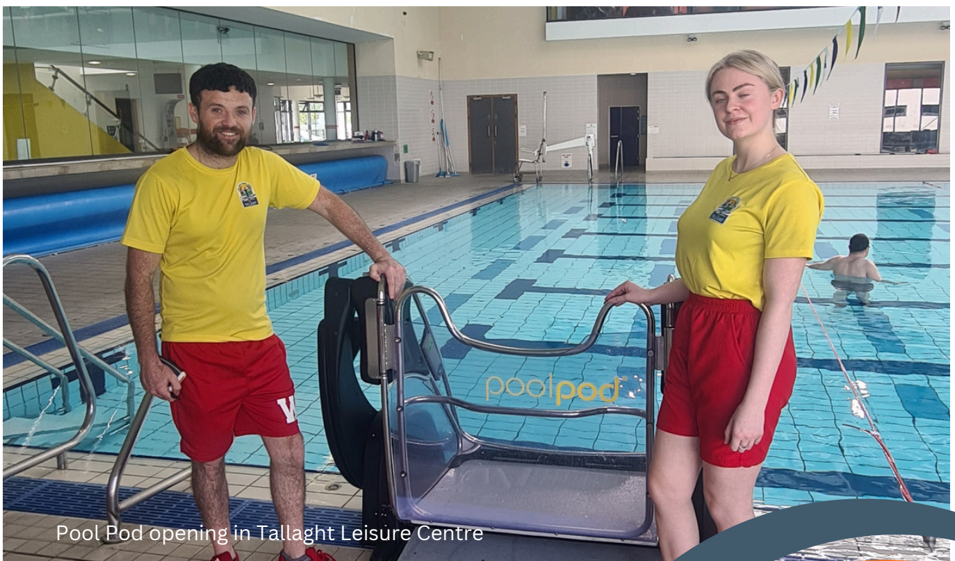
Pool Pod opening in Tallaght Leisure Centre

Another important component is the union of South Dublin Co. Sports Partnership and South Dublin Co. Co. sports office into one under Active South Dublin.