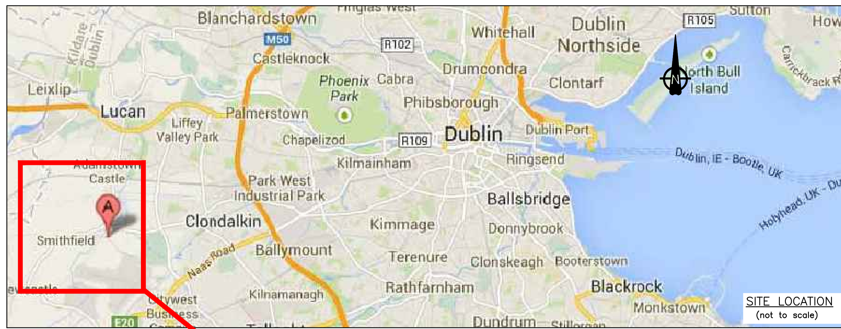
SITE LOCATION (not to scale)