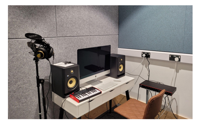
Fig 1, The Creative Studio at North Clondalkin Library

The Creative Studio at North Clondalkin Library is a facility that allows users to record music and podcasts in a soundproofed and fully equipped environment. We have a wide range of musical equipment and recording apparatus that users of the studio can avail of. Users can also bring in their own instruments to the studio.