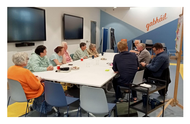
Fig 6: Consultation session with members of North Clondalkin library

Each session focused on a different theme relating to library activity. Across each two hour session, a diverse group of participants took part in specially designed discussion and reflection exercises.