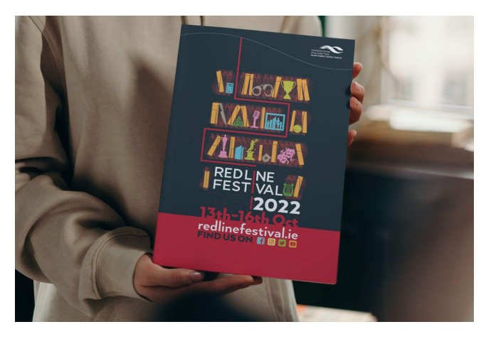
Fig.3 The Red Line festival programme 2022

The Red Line Festival is produced by South Dublin Libraries and Arts offering a programme of events and workshops that appeal to people of all ages and interests, from children to adults, casual readers to bookworms. The Red Line Festival features events in quality performance venues such as The Civic, historical buildings including Rathfarnham Castle and Pearse Museum at St. Enda's Park, along with our fantastic branch libraries across South Dublin County. Red Line 2022 saw the expansion of the festival beyond the book to include other cultural streams such as sport, music, theatre etc. From 'True Crime' with Paul Williams, Ex-State pathologist Dr Marie Cassidy and Private Investigator Patrick Marry to rapping with writer in residence Selló in partnership with NOISE Music, or readings of Ulysses at Rathfarnham Castle and a whole series of sports events at Tallaght Stadium, poetry awards and performances from DJs from 'Give Us The Night', the Red Line Festival was a celebration of all things literary be it spoken, written, sung, played, illustrated, or even just thought!