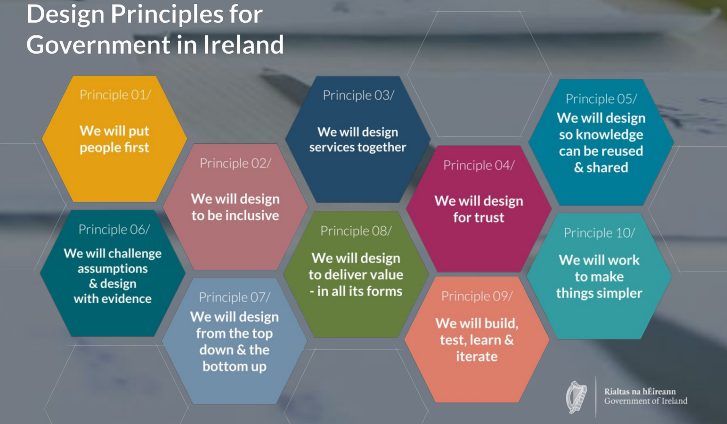
Fig 5. Design principles for government in Ireland

On the next page we detail some of the work carried out in this development of the 2023 - 2027 plan.