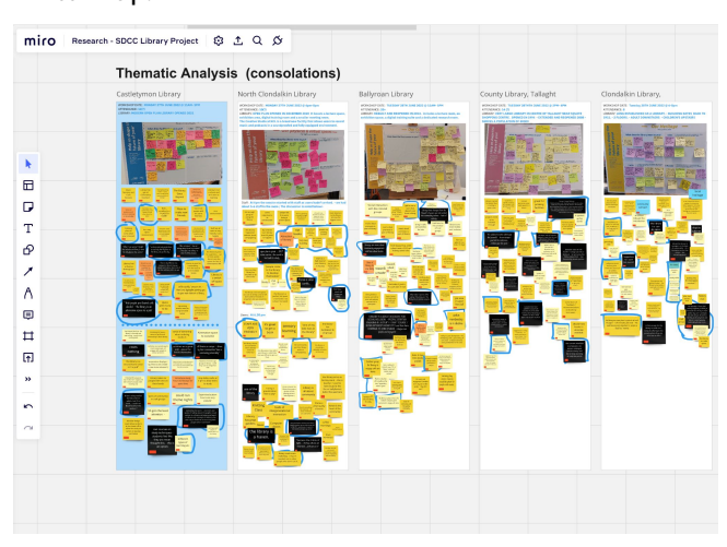
Fig 7: A section of the Miro software analysing consultation findings.

Across all of the research, a large amount of data was collected. This data was reviewed by the research team and sorted into a number of themes. Both analogue approaches and digital analysis using the collaboration software Miro was used throughout the process. Themes were discussed with SDL leadership and key insights and challenges were framed and written up.