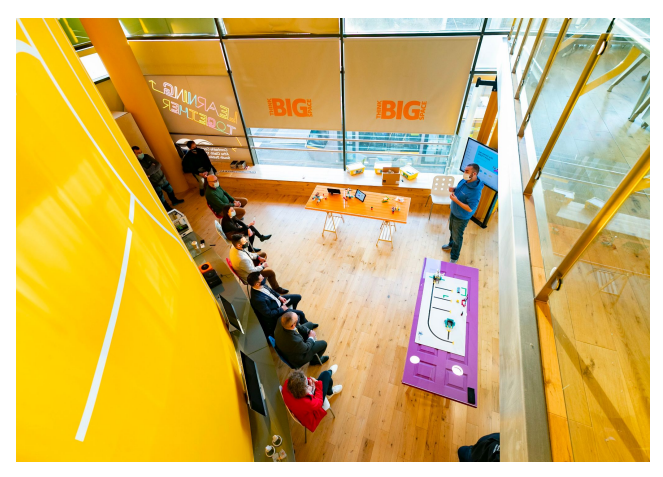
Fig. 2 The Think Big space

In November 2022, Chambers Ireland awarded Think Big Space an Excellence in Local Government Award under the Local Authority Innovation category.