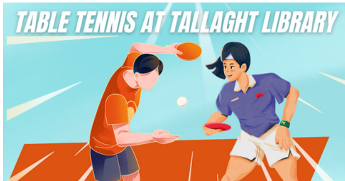
Table Tennis Club