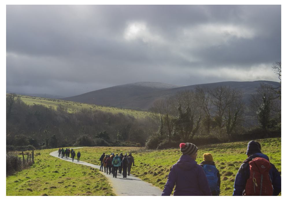
Rock to the Top Ciaran Taylor IN CONTEXT 4 - In Our Time