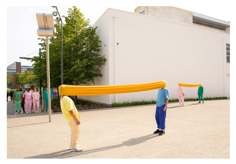
OutWall Selma Daniel

In 2024, Strand 1 of IN CONTEXT 5 - Connect took place, with six public art works commissioned that had a particular focus on engaging early years, children, young people and their communities, in Firhouse, West Tallaght and Clondalkin. For more information on Strand 1, please visit the IN CONTEXT website <u>www.incontext.ie</u>.