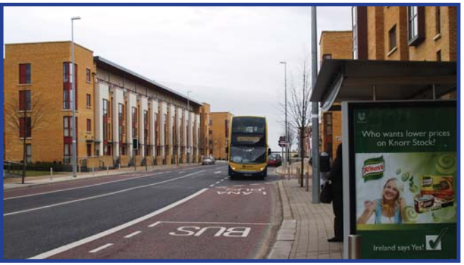
New 25b bus service within Adamstown

The new 25B bus service has replaced the 151 service in November 2010, as the primary route serving the southern area of Adamstown. The 25b service runs from the terminus at Adamstown Train Station to Merrion Square, via Adamstown Avenue, Castlegate Way, Esker Road, Griffeen Avenue, Foxborough, Ballyowen Road, Lucan Road, the N4 at Woodies, Hermitage, Liffey Valley, Palmerstown, Chapelizod bypass, Heuston Station, Merchants Quay, Aston Quay, Dawson Street, and Leeson Street. A limited number of services start at Aston Quay in Dublin City and Foxborough in Lucan. The 25b service overlaps with the 25a service on Esker Road; the route veers south to serve residential areas along Griffeen Avenue; and links back up to the 25a route at Griffeen Road for the remainder of the route.