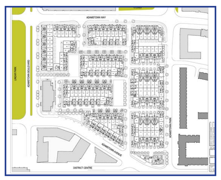
Proposed revised layout for Adamstown Sqaure 3 area

Pre-planning discussions are ongoing with Maplewood Development to revise Phase 2A (SDZ07A/0001) and 2B (SDZ08A/0005) of The Paddocks. This is likely to result in an increase in the number of individual family houses, and a reduction in the number of apartments permitted.