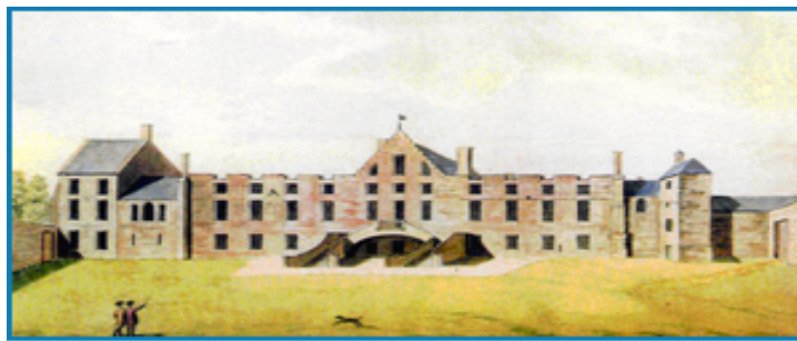
Beranger's 1771 drawing