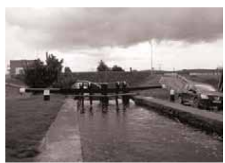
The Grand Canal at Killeen Road