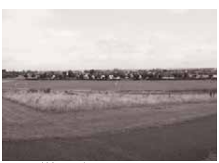
Green Hills park