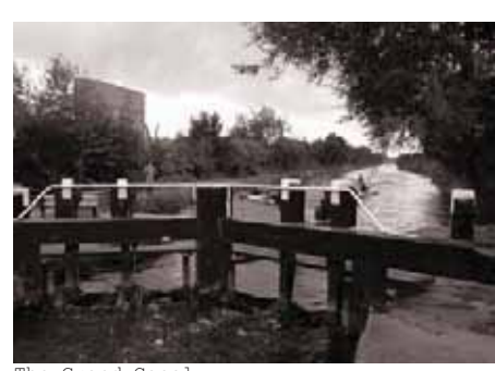
The Grand Canal