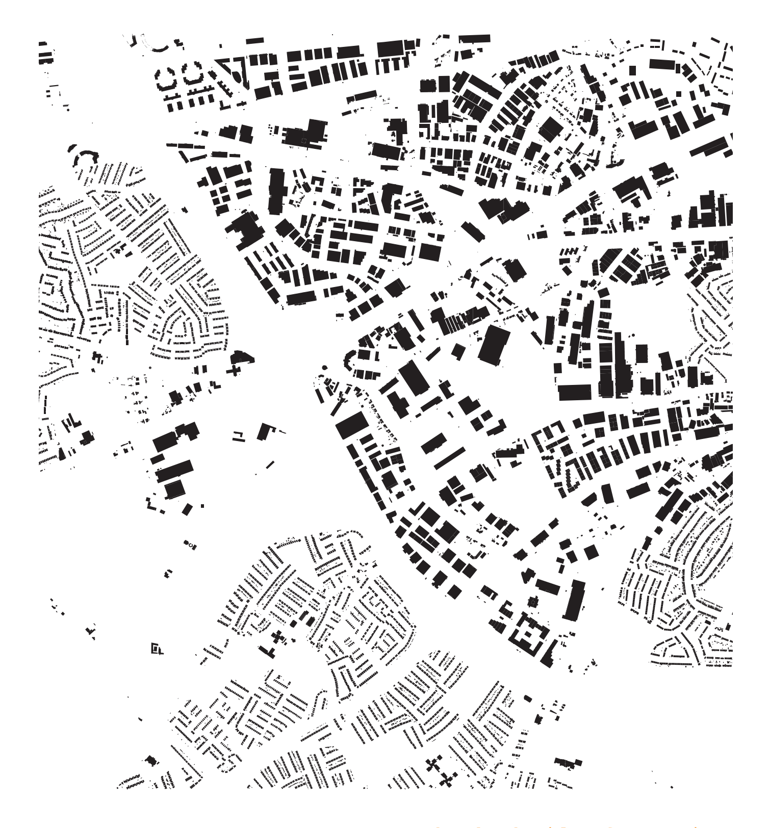
today's built footprint