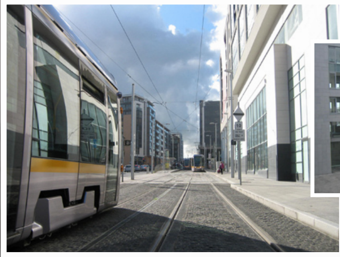
Tallaght Cross / Luas Terminus