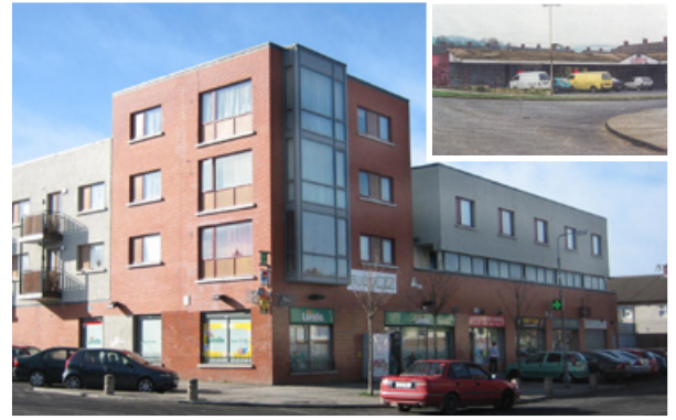
Kiltalown Neighbourhood Centre (before and after)

The County Council's Fund is based on the sale of Council owned designated sites and the future receipts from the first 5 years of rates on the Town Centre development sites. The sale of the Council land has generated over €5 million. While the income from rates has just commenced, the final fund will be significant due to the extent of commercial development underway. A considerable amount of this fund has already been expended on infrastructural projects in the disadvantaged communities, as in 1999 South Dublin County Council agreed to underwrite a number of the South Dublin URBAN Initiative projects that had significant shortfalls in funding - see table below. Provision was made in the Tallaght IAP to utilise the IAP Funding Package to ensure final funding for these now completed projects.