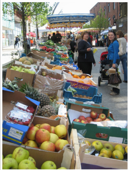
Farmers market - High Street