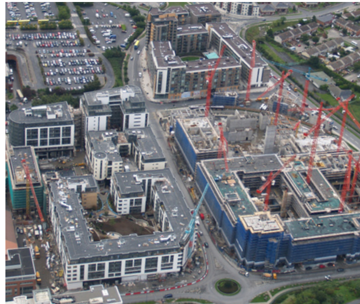
Tallaght Town Centre (2007)

Funding of €502,037 has also been allocated to 17 small infrastructural/environmental projects in Tallaght.