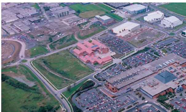
Tallaght Town Centre pre-IAP (1996)

T wo sources of funding have been established in the IAP, the County Council's Financial Package and the Community Linkage Contribution . It is intended that the resources from both funds will be utilised in disadvantaged neighbourhoods in West Tallaght in accordance with the vision detailed in the IAP and the RAPID Plan for the area.