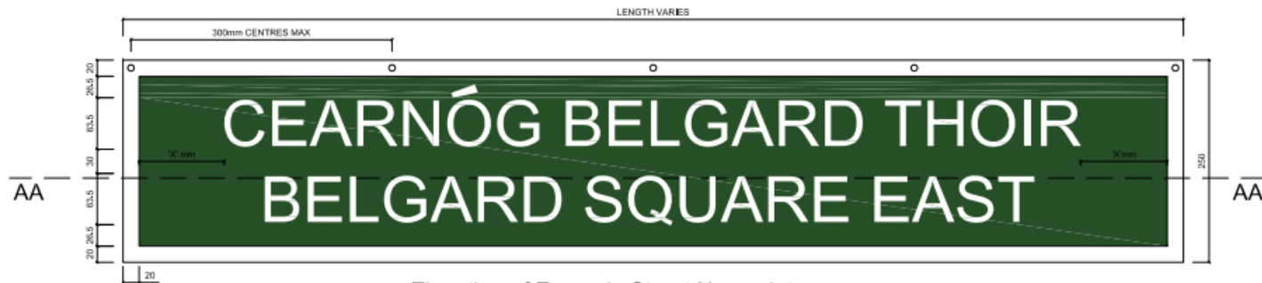
Elevation of Example Street Nameplate