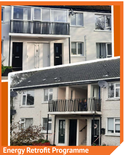
Funding for 2025

most recent youth conference held in October 2024, members of the Comhairle will continue their focus on mental health issues throughout 2025.