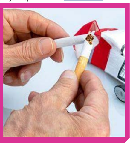
Sláintecare Healthy Communities Programme Smoking Cessation

The LAMA Awards, which are now in their 19th year, continue to grow in stature, with 311 nominations from local councils across Ireland this year. For more information about our award-winning projects, please visit www.sdcc.ie