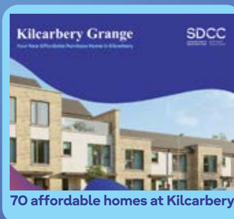
70 affordable homes at Kilcarbery

Please see sdcc.ie this month for details on how to register interest for these homes.