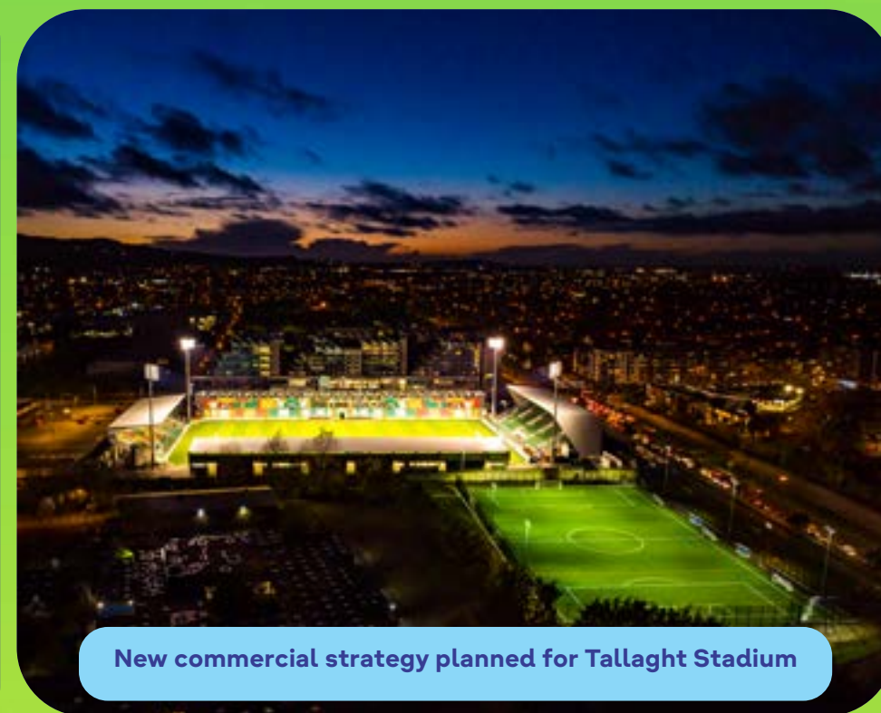
New commercial strategy planned for Tallaght Stadium

Under the programme, one student is now working with our economic development team and we look forward to further developing this collaboration in the years ahead, reflecting our corporate commitment to creating greater opportunity for all in South Dublin.