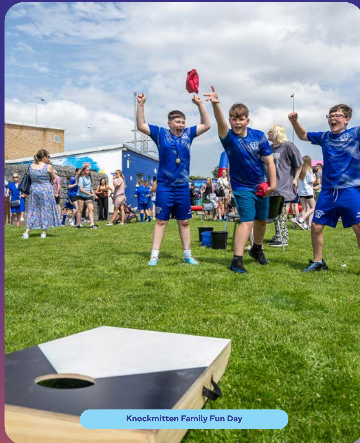
Knockmitten Family Fun Day