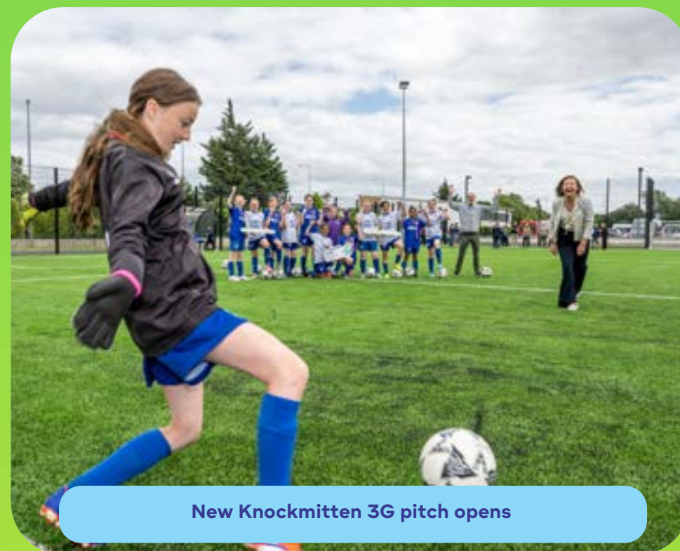
New Knockmitten 3G pitch opens

Since its introduction, the innovative scheme has successfully diverted over one tonne of paint from landfill to support sustainability and better community access to affordable resources.