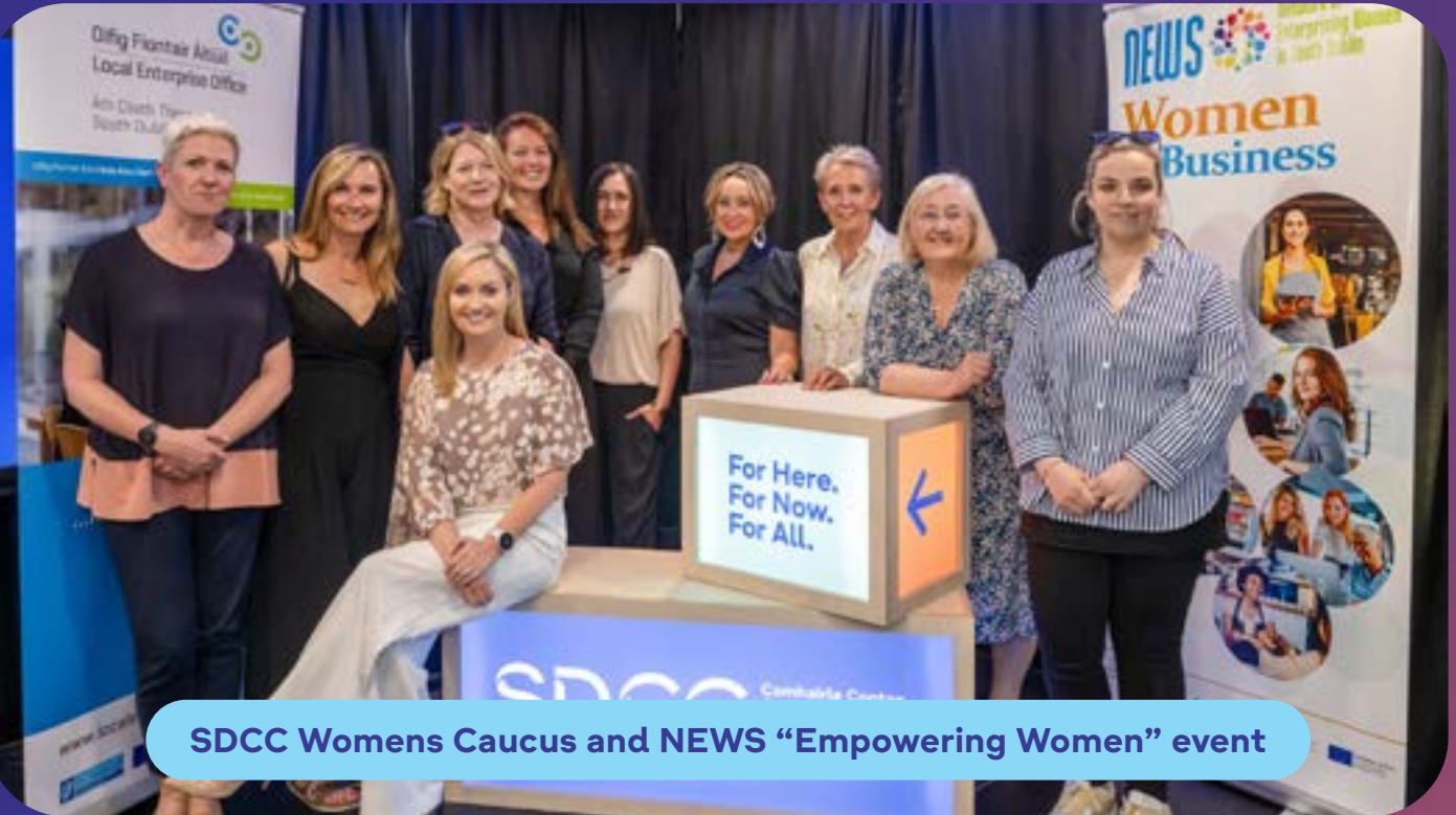
SDCC Womens Caucus and NEWS "Empowering Women" event