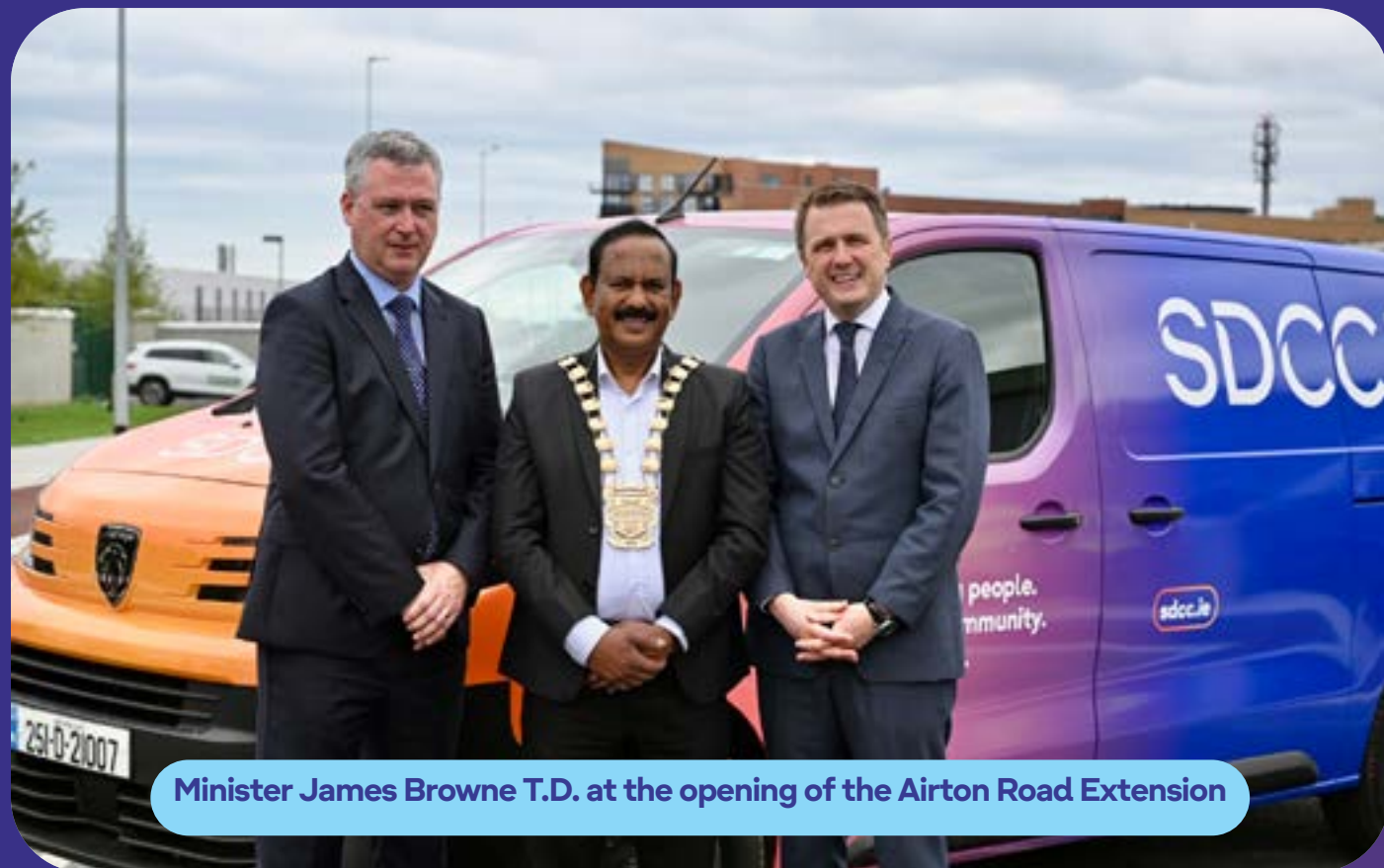
Minister James Browne T.D. at the opening of the Airton Road Extension