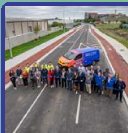
Officially opening of Airton Road Extension

Development Act to ensure we plan responsibly for a growing and thriving future South Dublin.