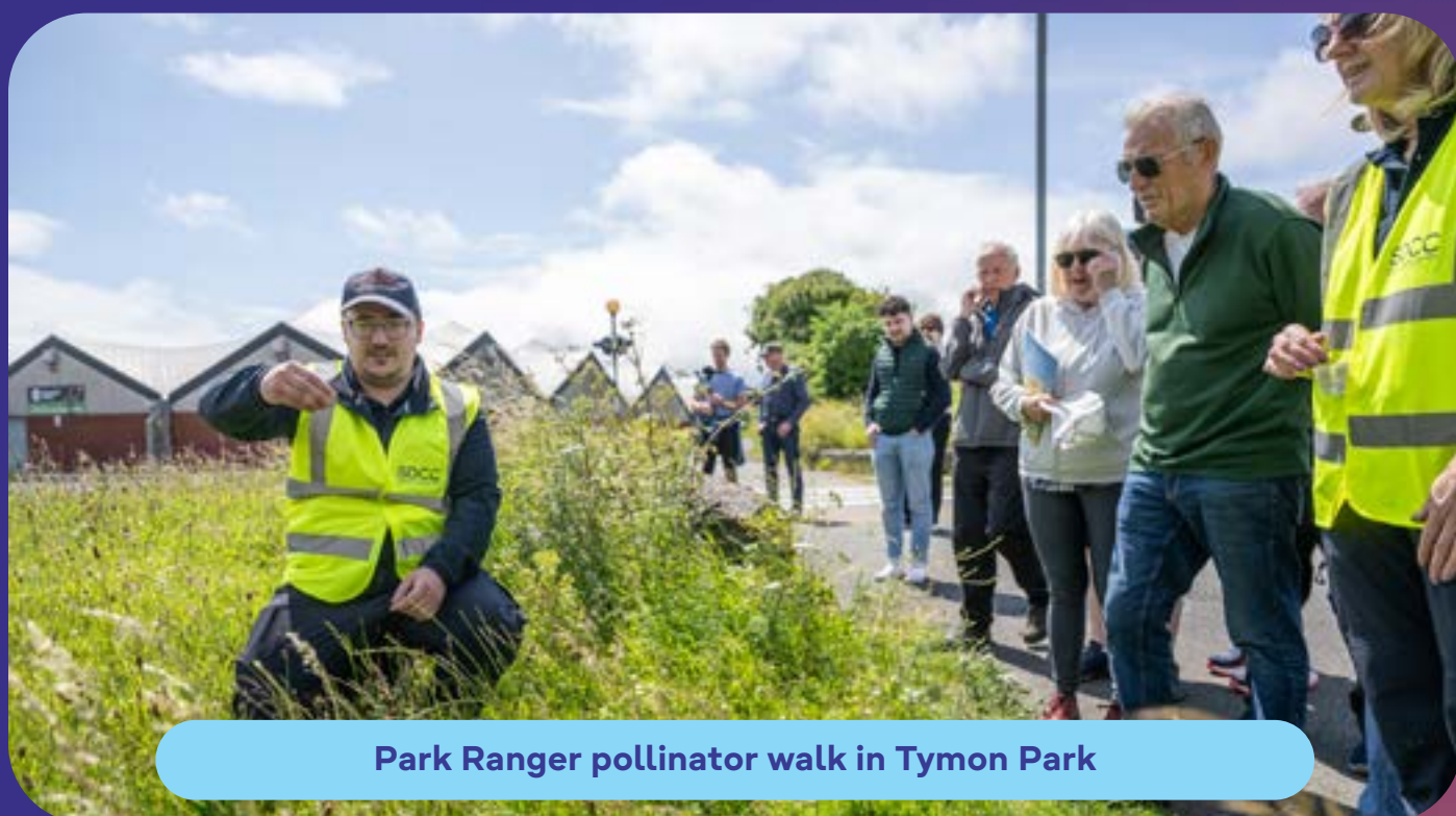
Park Ranger pollinator walk in Tymon Park