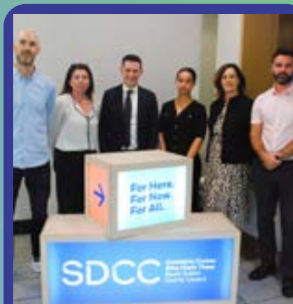
DCU Access Programme

dedicated food production hub in Tallaght, further strengthening the local food economy and supporting a thriving, sustainable sector.