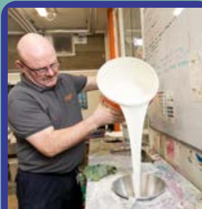
Rediscover paint at Ballymount Civic Amenity Paint Re-use scheme

dedicated staff and management of the community centre, whose collaboration and support helped bring this project to life, creating space that reflects and supports community and integration.