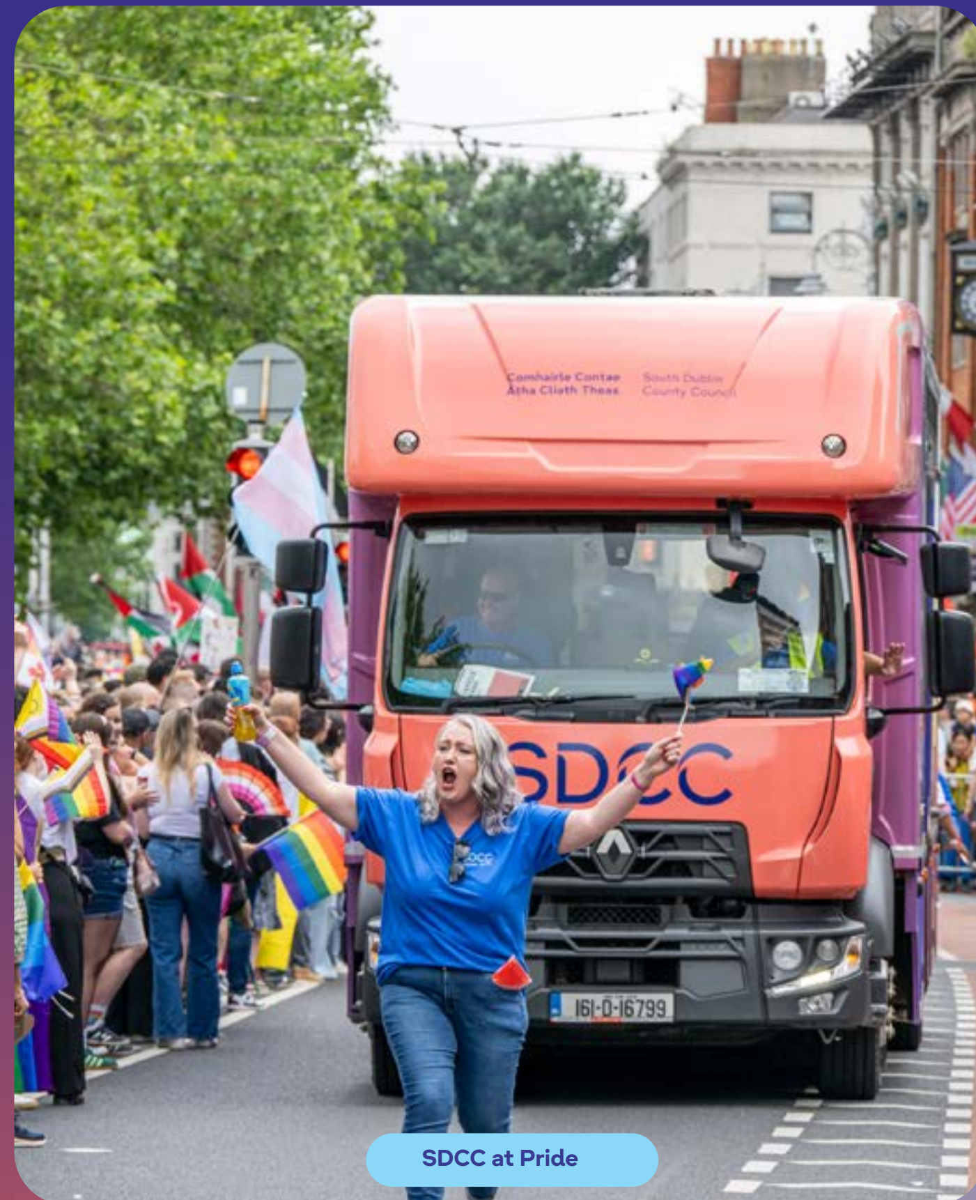
SDCC at Pride