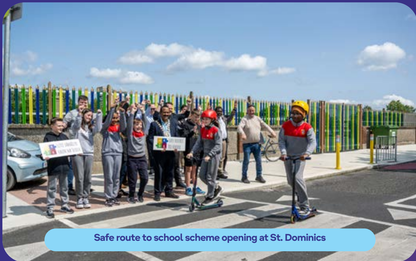
Safe route to school scheme opening at St. Dominics