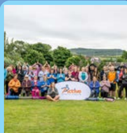
Park Yoga returns with Active Parks 2025

resilience and richness that diversity brings to South Dublin showing that together, we are building a more inclusive and connected community.