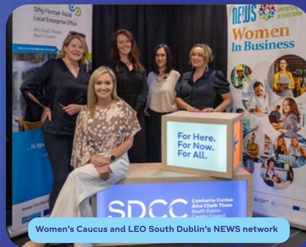
Women's Caucus and LEO South Dublin's NEWS network

Find out more and book your free place at "Free Active Parks 2025" on eventbrite.ie .