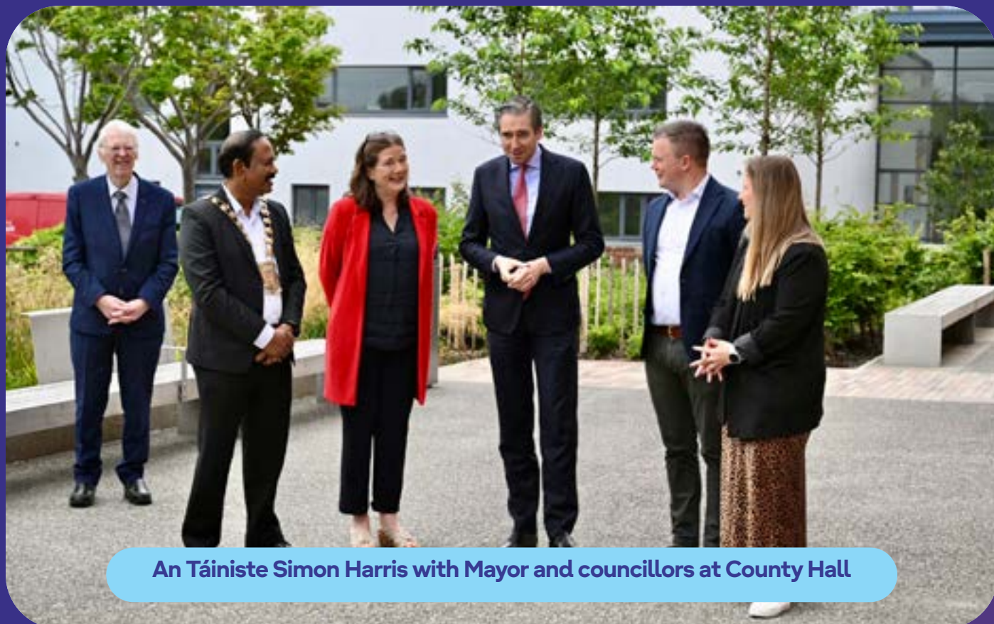
An Táiniste Simon Harris with Mayor and councillors at County Hall