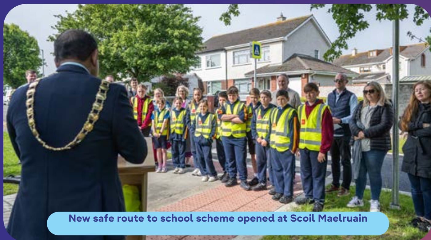
New safe route to school scheme opened at Scoil Maelruain