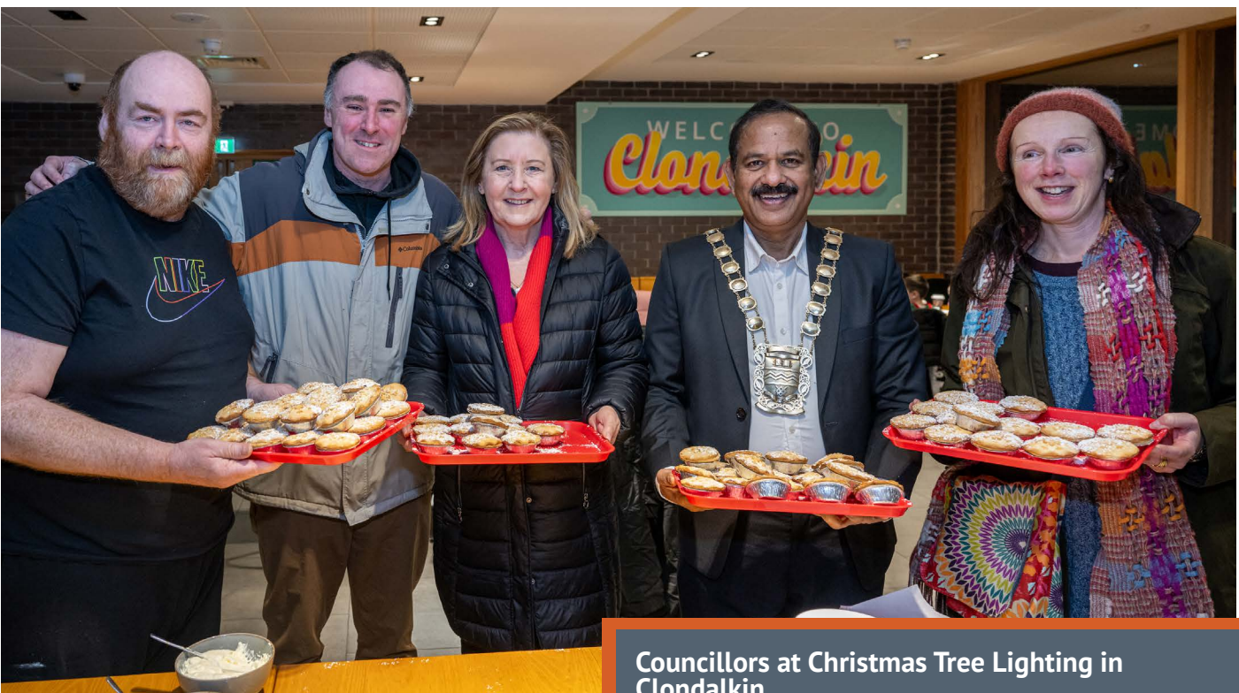
Councillors at Christmas Tree Lighting in Clondalkin