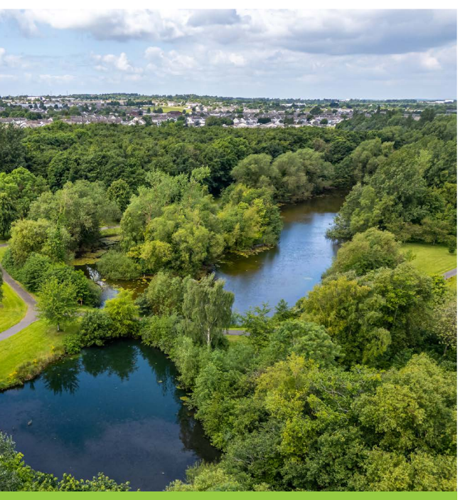
Tymon Park, one of our five parks awarded Green Flags

A community team is being formed to sdcc.ie/en/climate-action/clondalkindz/ for more info