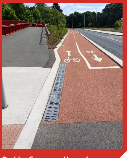
Dodder Greenway Upgrades

The delivery of the programme will continue into 2025 with significant NTA and Council funding available to help develop facilities on significant routes.