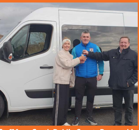
Staff from South Dublin County Partnership receiving the keys to their new bus