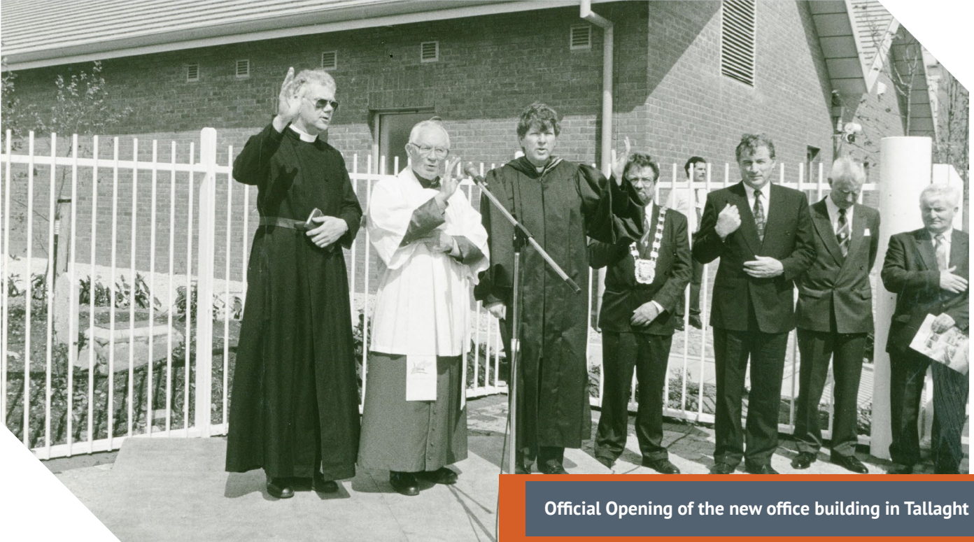
County Library Tallaght, which also opened 30 years ago

Staff moved to the newly built offices in 1994 to take up their new positions. They had been given the option of moving