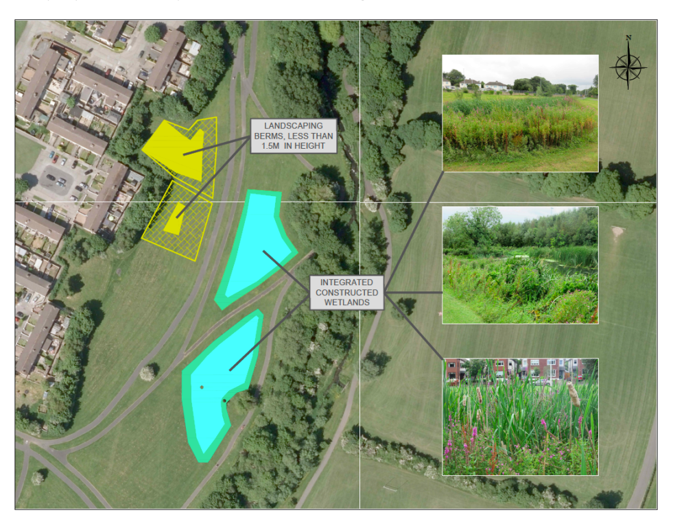
Figure 2 Proposed Site Plan

The proposed site layout is illustrated on Figure 2.