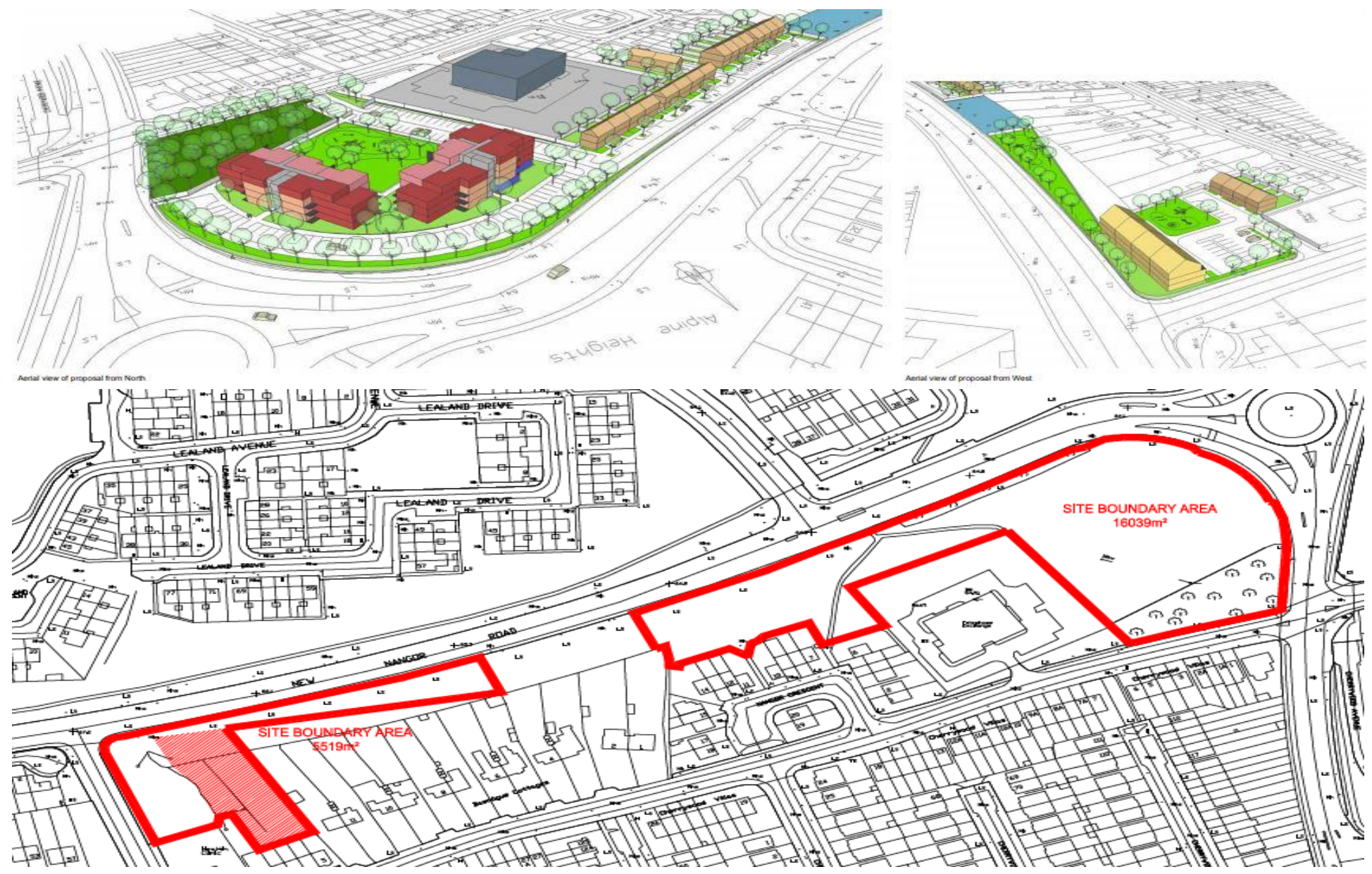
Design & Site Boundaries of Proposed Development