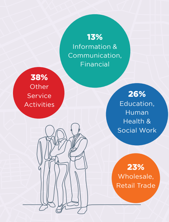
Employment of the Day Time Population

The provision of a broad range of retail services contributes towards the creation of a vibrant living place. There are retail opportunity sites and vacant units in the core retail areas of this Neighbourhood. The projected population growth and increased consumer expenditure will support the long-term viability of these retail